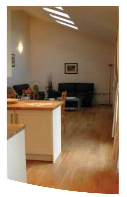
The Stables interior, London N1 Papa Architects