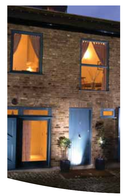
The Stables, London N1 Papa Architects